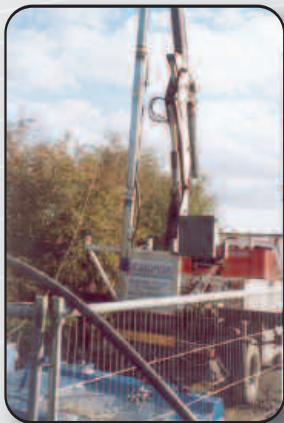
● Campion Rig Installation.