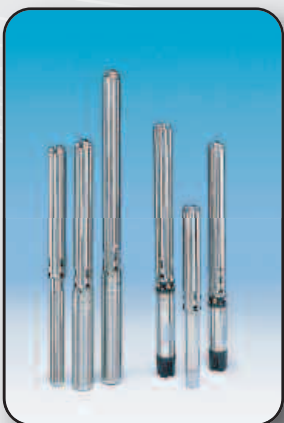
● Sample of Range.

For more information just give us a call !