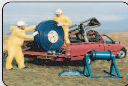
● Well Master Pumping.