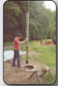
● Pump Install.